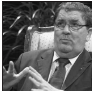
The Hon. John Hume