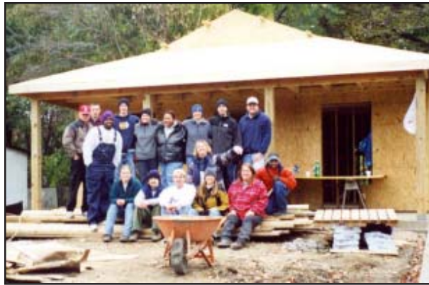
AMPAS participate in a public service project with Habitat for Humanity.

On Nov. 2 AMPAS put on their tool belts and climbed a ladder to help Habitat for Humanity build a house. Approximately 14 AMPAS members participated in this all-day effort. The future owner of the house, a young mother of two, worked side-by-side with AMPAS, which added insight into some of the issues the family faces. Although no one fell off the roof, which was completed by AMPAS, several thumbs did incur hammer injuries.